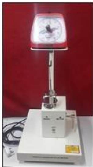
Digital Cohesion Value Meter